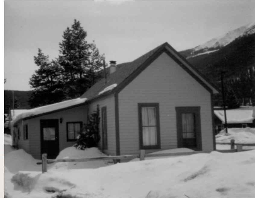
Mary Ruth House

The National Park Service describes historic preservation as, “a naturally sustainable practice...with existing buildings and materials as the ultimate recycling project.”