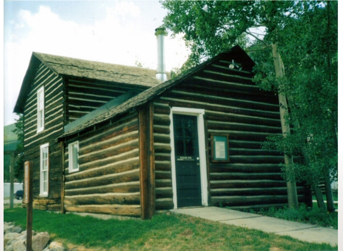
Bill's Ranch House